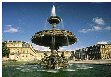
central square in Stuttgart

Nearly 45% of Baden-Württemberg's research and development facilities are located in Stuttgart, causing a top-ranking among Germany's educational centres. Elementary and vocational schools, high schools, universities, technical colleges and many other educational facilities contribute to a wide spectrum.