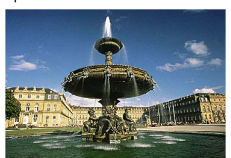
central square in Stuttgart

Nearly 45% of Baden-Württemberg's research and development facilities are located in Stuttgart, causing a top-ranking among Germany's educational centres. Elementary and vocational schools, high schools, universities, technical colleges and many other educational facilities contribute to a wide spectrum.